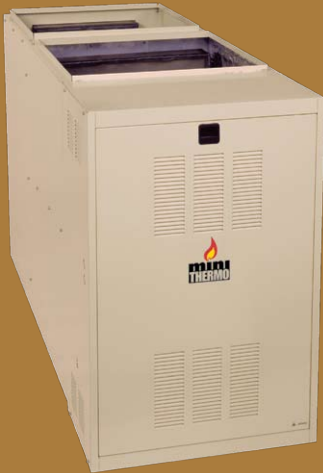
With optional vestibule