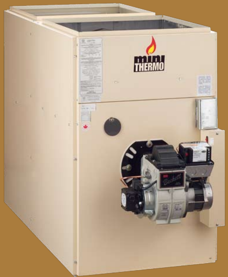
Standard (no vestibule)